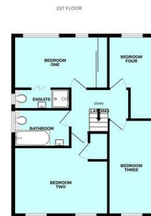
Made with Mergin 02026